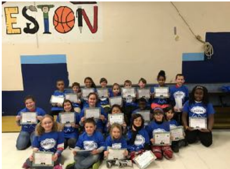
January, February & March Weston Blue Ribbon Winners